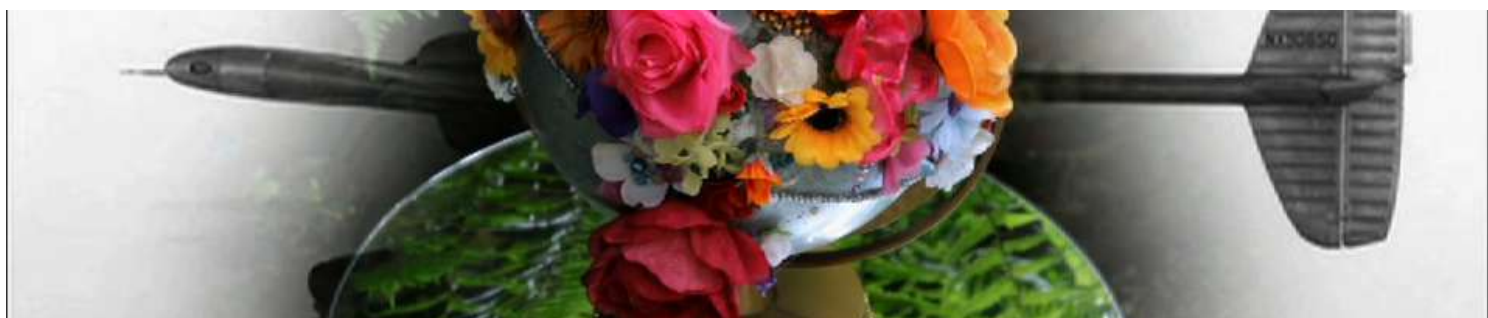
The cry of silence / Malubéa (Belgique)

Inspired by *the tri-continental, anti-imperialist solidarity movements of the 1960s and 80s, at the crossroads of militant, artistic and museological practices that created a very particular form of museum of solidarity, without walls, and more often than not, museums in exile (in support of the people of Chile, Nicaragua, South Africa and of course Palestine), the A.M.Qattan Foundation and Les Instants vidéo launched a call for solidarity.